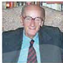
Dr Endre Mester The father of laser therapy

Low level laser was discovered in 1967 by Dr Endre Mester in Semmelweis University in Hungary Budapest of Germany. Dr Endre Mester originally intended to find out if laser could cause cancer. During the experiment, he used mice in his study. After shaving the hair of the mice, he divided them into two groups, one group was under low level laser irradiation, while the other group in the normal environment. Finally he came to the amazing finding – the group with low level laser irradiation did not develop cancer. Furthermore, the hair of the mice in this group grew faster and more vigorously. This is how the "Low Level Laser Therapy" was discovered.